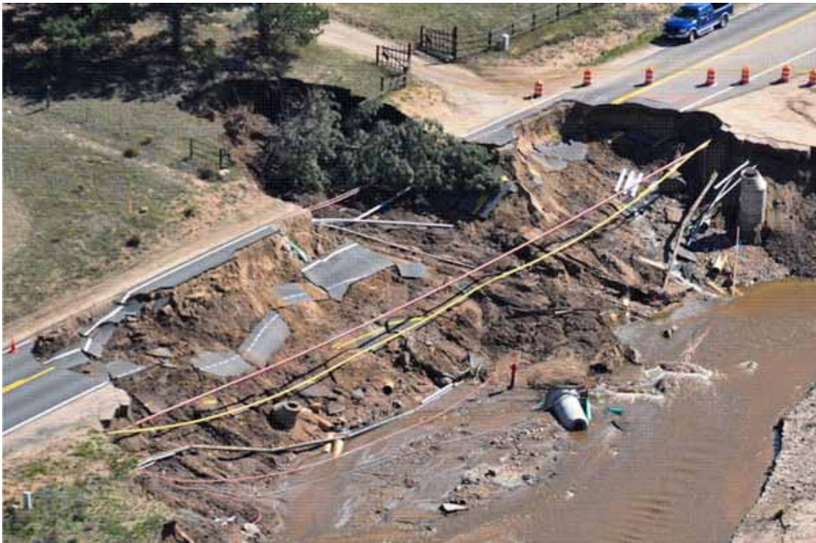
Larimer County Engineering Department

As the Colorado Climate Change Vulnerability Study (2015) states, no systematic analyses have yet been undertaken to identify the climate-related risks to Colorado’s transportation sector. 78 The same is true for other infrastructure systems in the state. Similarly, little consideration of climate-related risks to infrastructure systems has gone into planning and managing these systems. Yet infrastructure systems are vulnerable to many other climate-related risks beyond those arising from extreme events and