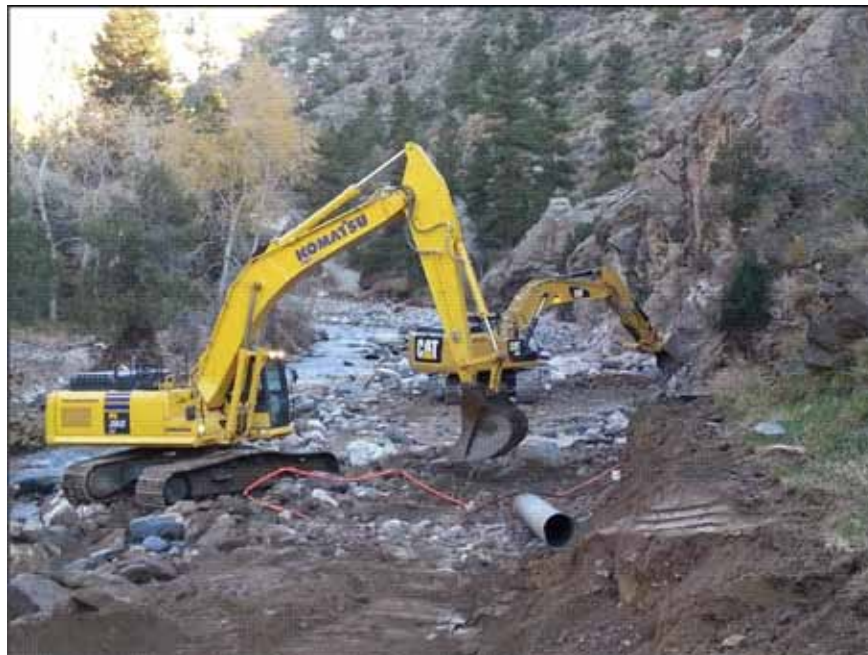
Larimer County Engineering Department